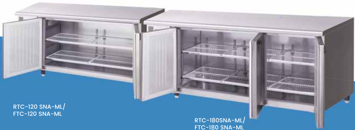
RTC-120 SNA-ML/ FTC-120 SNA-ML

The Pillar Less range of refrigerator and freezers configured as counters are suitable for kitchens that wish to maximise both food preparation area and storage.