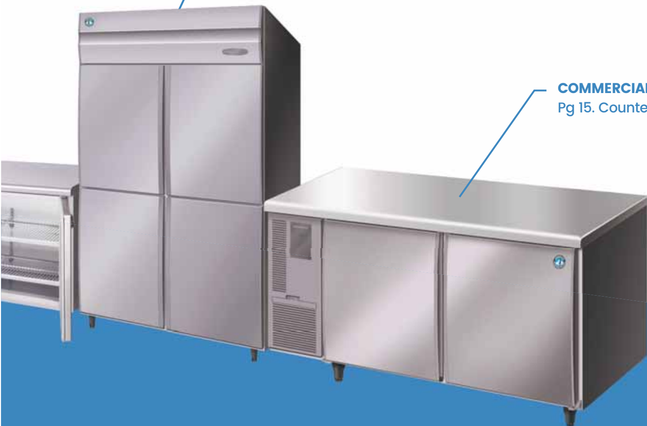
COMMERCIAL SERIES Pg 15. Counter